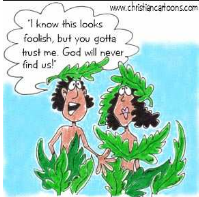
Adam and Eve: The original designers of camouflage clothing.